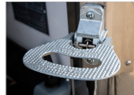
Folding reefer steps