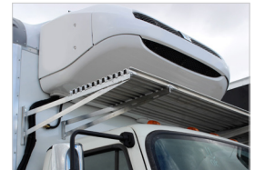
Reefer service platform